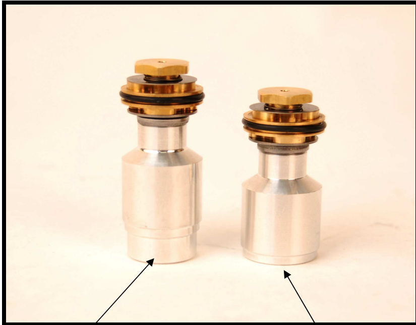
2004+ Race Tech Complete Compression Valve Assembly Kit FMGV S2057C (Long Base)